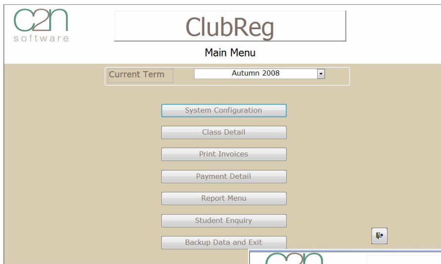
Main Menu screen